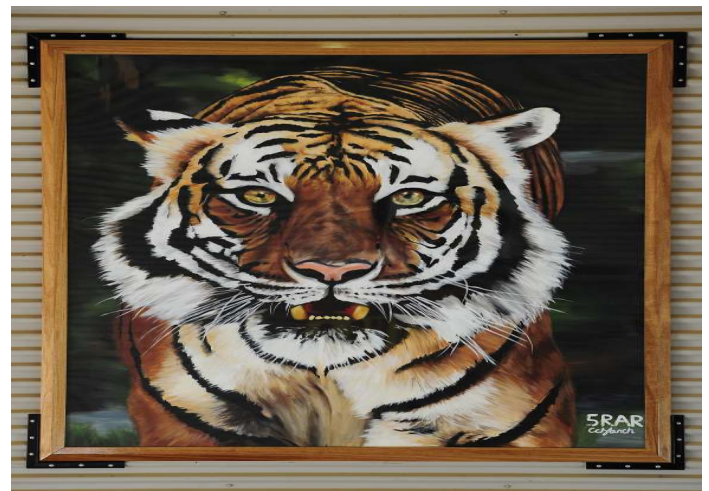
5 RAR Tiger Painting

Almost immediately the male cub was named Quintus, after the Latin numeral five, and was integrated into the unit with the service number, MA423. Later to be promoted to the rank of Warrant Officer Class Two, Quintus was to become the first of many Tiger mascots that 5 RAR (MECH) has had during its short but illustrious history.